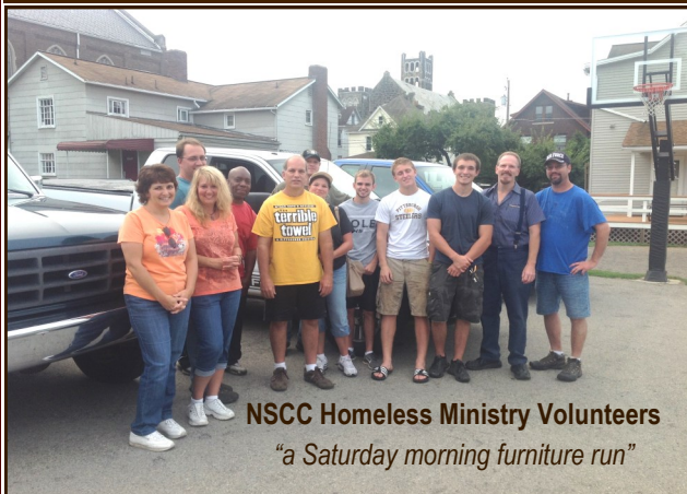
NSCC Homeless Ministry Volunteers "a Saturday morning furniture run"

Loving God, Loving People - Here and Now!